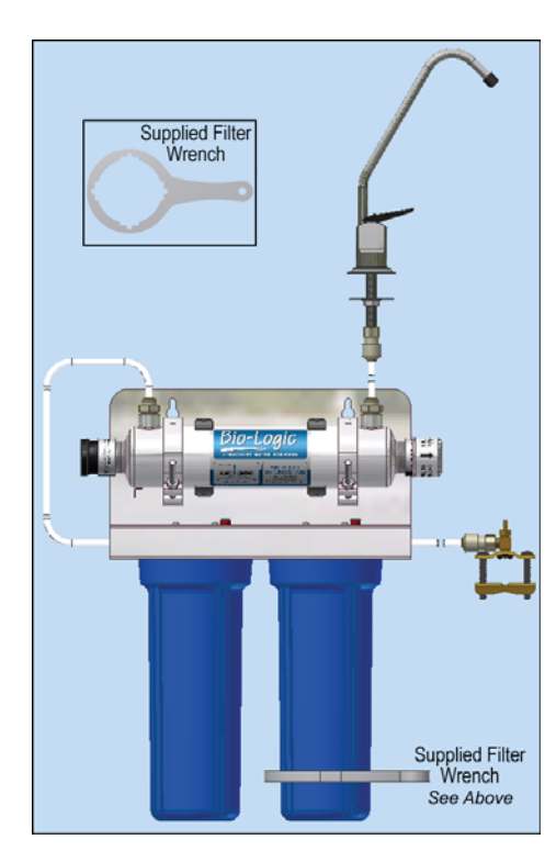
Model 1.5 GPM