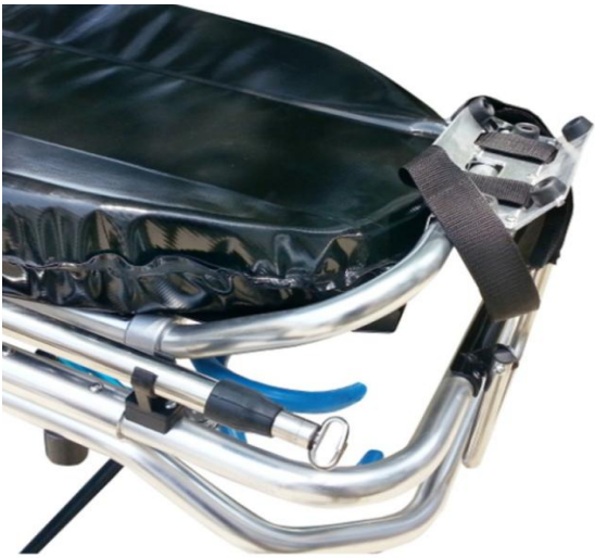
O2 TANK HOLDER INCLUDED