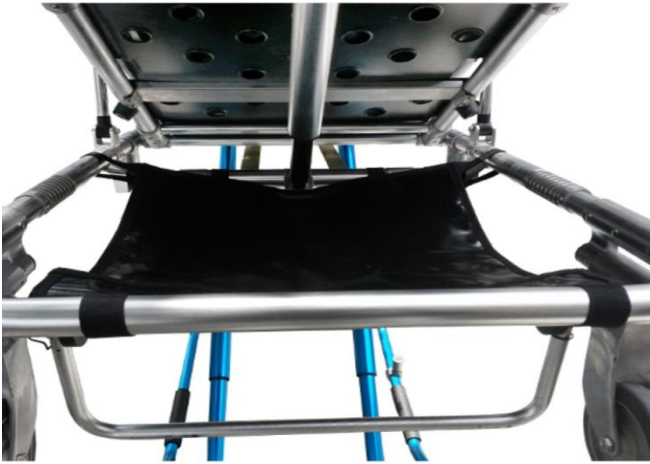
DOCUMENT POUCH INCLUDED