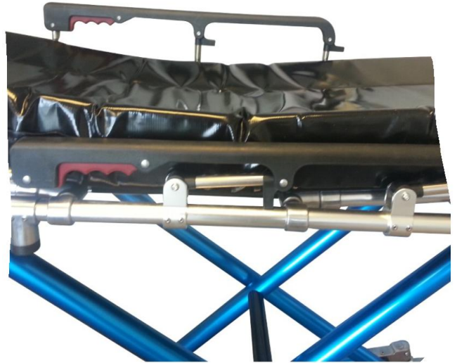
Easy Grip Collapsible Side Rails