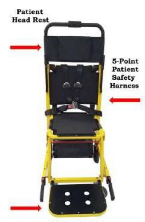
Solid Footrest for Added Patient Safety